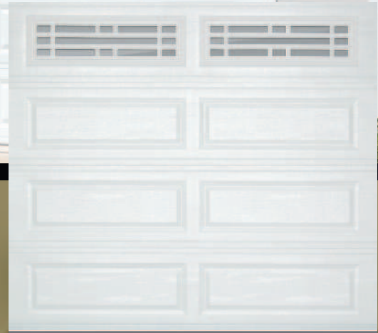
8' x 7' 4240 white with optional mission window inserts