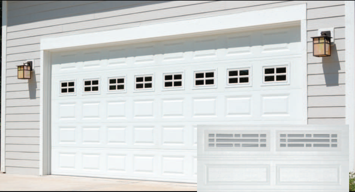
Pictured. 18' x 8' 2241 white with optional stockton window inserts