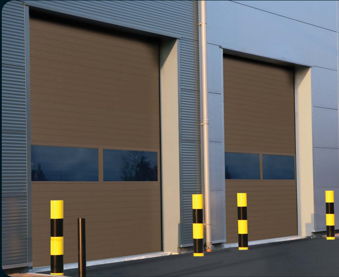
Raynor TC200, 8' x 12' in sepia with full view aluminum ranch windows